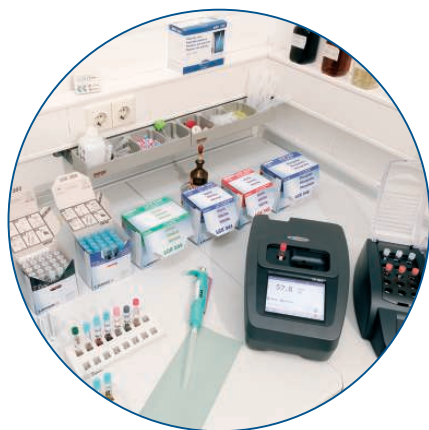
Fig. 6: As well as COD, LANGE cuvette tests determine NH 4 , AOX, NO 3 , NO 2 , PO 4 , N tot in leachate

Ready to use and predosed reagents for COD chromosulphuric acid and mercury sulphate. The closed cuvette test system guarantees maximum safety – for the analyst and the surroundings. This simple handling excludes error sources from the very beginning.