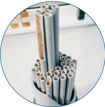
Fig. 4: Cut open view of the tube module of the ultrafiltration system: space saving solids separation

A positive pressure of 3 bar improves oxygen solubility in the two aerated tanks. Should the continuously monitored ammonium content in the outflow nevertheless exceed 3 mg/l, pure oxygen is automatically injected into both tanks in order to boost nitrification.