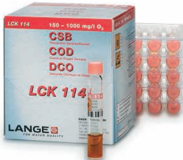
Fig 1: The degradation performance of the activated carbon filters is determined with the LANGE COD cuvette test